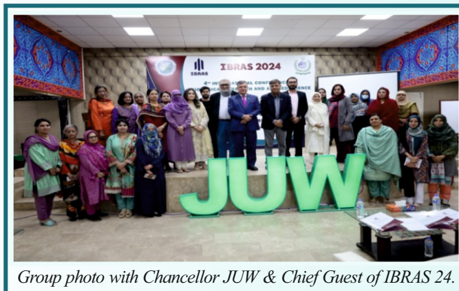
Group photo with Chancellor JUW & Chief Guest of IBRAS 24.