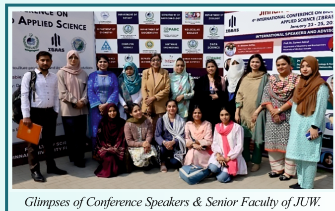
Glimpses of Conference Speakers & Senior Faculty of JUW.