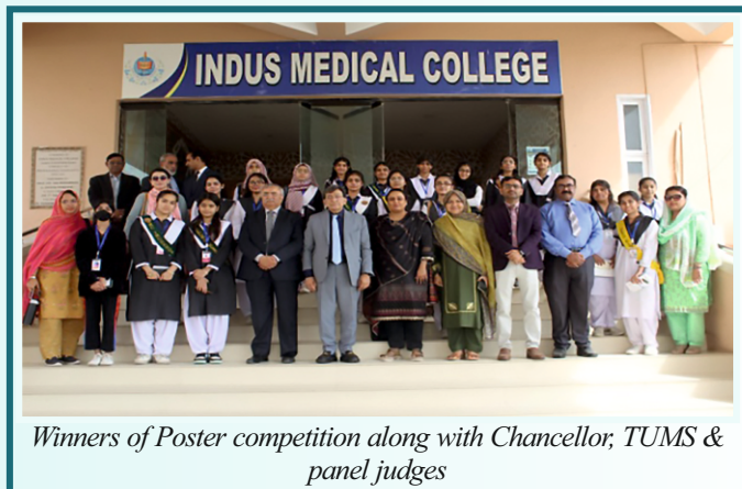
Winners of Poster competition along with Chancellor, TUMS & panel judges