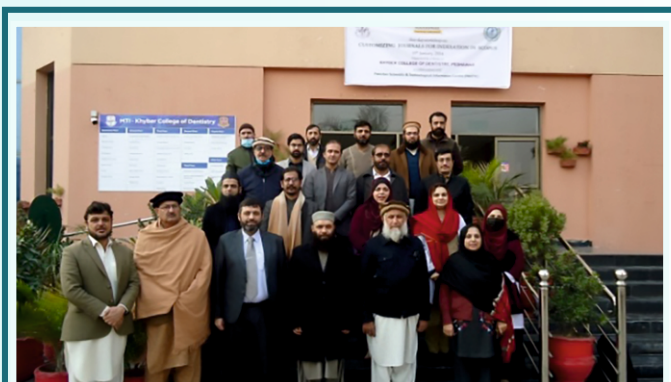
A group photo of Guests, Faculty Members and participants of workshop on "Customizing Journals for Indexation in SCOPUS"

A total of 25 participants representing all major Universities including Khyber Medical University Peshawar, University of Science & Technology Bannu, NCE in Geology, University of Peshawar, University of Haripur, Women University Mardan, Abdul Wali Khan University Mardan, Institute of Management Sciences Peshawar, Swabi College of Education Mardan, Khyber College of Dentistry Peshawar, Gomal Medical College D.I. Khan, Medical Research Pvt. Ltd. Institute of Excellence in Education and Research Peshawar and Peshawar Institute of Research D.I. Khan attended the session.